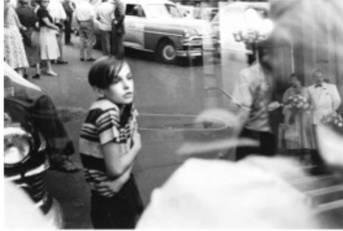
Louis Faurer Accident, New York c. 1949-1952