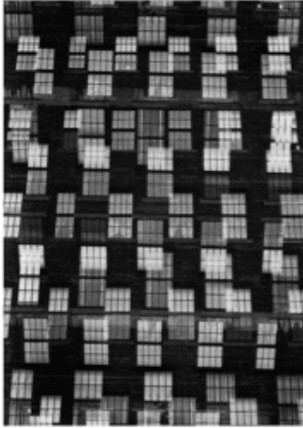
Harry Callahan Chicago c. 1948